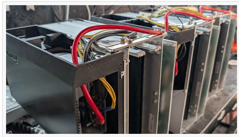
Antminer Loki Rig Mods with APW3 Side Hodler

D-Central Technologies, with years of experience in Bitcoin mining hosting, ASIC repairs, and 3D printing, has developed a comprehensive suite of products tailored for home miners. Among these innovations is the Bitcoin Mining Heater, a device that addresses real-world challenges such as heating expenses by allowing users to mine Bitcoin while efficiently warming their homes. This dual-purpose solution exemplifies D-Central's commitment to practical and sustainable mining technologies.