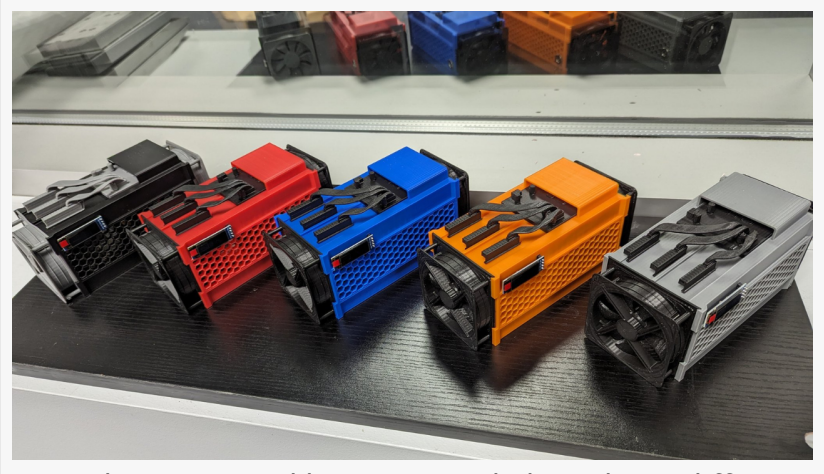
5 Minibits powered by Bitaxe, side by side, in different colors

climate has reignited interest in Bitcoin mining, particularly among individuals seeking to contribute to network decentralization and capitalize on potential financial gains.