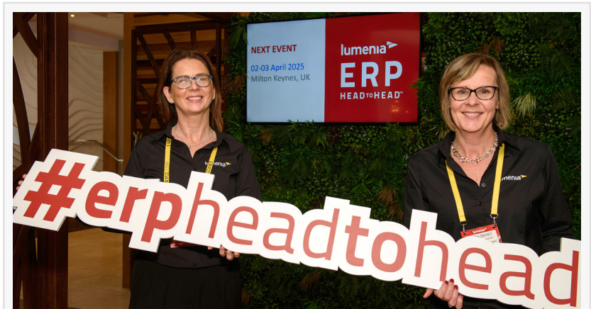
ERP System Comparison and Selection made easy at the ERP HEADtoHEAD event