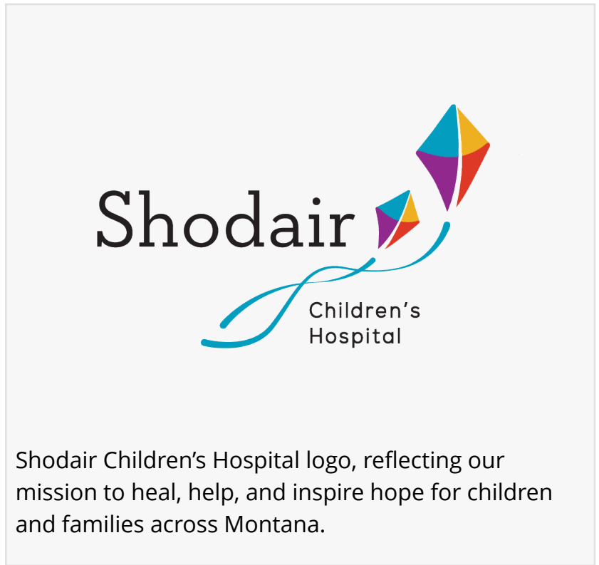
Shodair Children's Hospital logo, reflecting our mission to heal, help, and inspire hope for children and families across Montana.

- Unfunded Care Rising: Despite increasing financial strain, Shodair remains committed to providing pediatric mental health services, even as facilities nationwide close due to unsustainable reimbursement rates.