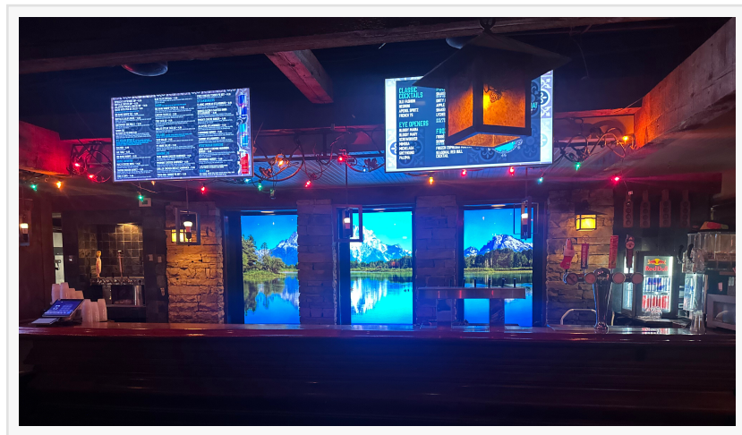
Park Tavern Ski Lodge in Atlanta, GA

ATLANTA, GA, UNITED STATES, January 21, 2025 /EINPresswire.com/ -- Park Tavern, the iconic destination on the Atlanta Beltline, is thrilled to announce its newest transformation: the Park Tavern Ski Lodge. This inviting space brings the charm and coziness of a Colorado ski lodge to Midtown Atlanta, offering guests a warm escape featuring stacked stone fireplaces,