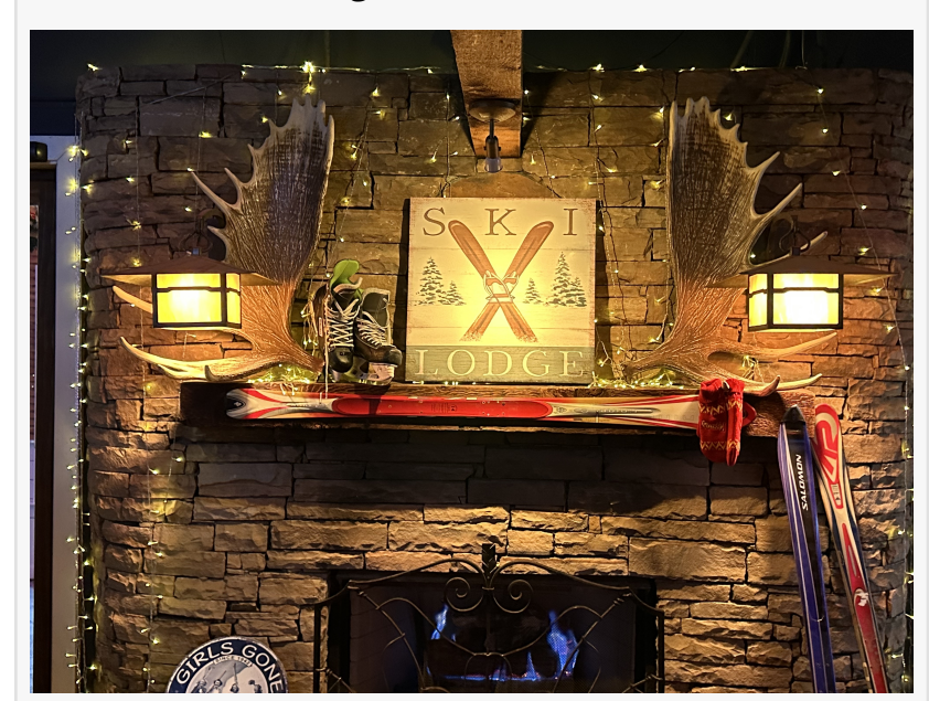
Park Tavern Ski Lodge Fireplace Atlanta, GA

For more information or to purchase tickets for Oysterfest and the Après Ski Festival, visit <a href="https://www.parktavern.com">www.parktavern.com</a> or follow Park Tavern on social media.