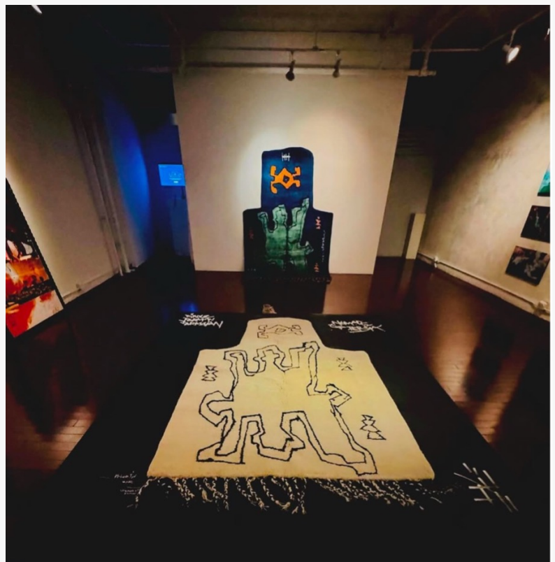
Nomads of Persia exhibition at Salomon Gallery