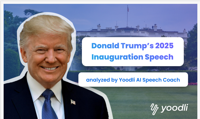
Donald Trump AI Speech Coach

For President Donald Trump's inauguration speech on January 20, Yoodli highlighted key strengths in its analysis. The speech had a clear and consistent "America First" message, which resonated throughout. Trump's demeanor was confident and assertive, commanding attention without hesitation. His delivery had 0% filler words, reinforcing a sense of control and authority. His pace, at a conversational 130 words per minute, ensured clarity and maintained audience engagement. At no point did his pacing suggest nervousness, demonstrating composure under the spotlight. 20% of sentences starting with "We," which underscored a collective vision.