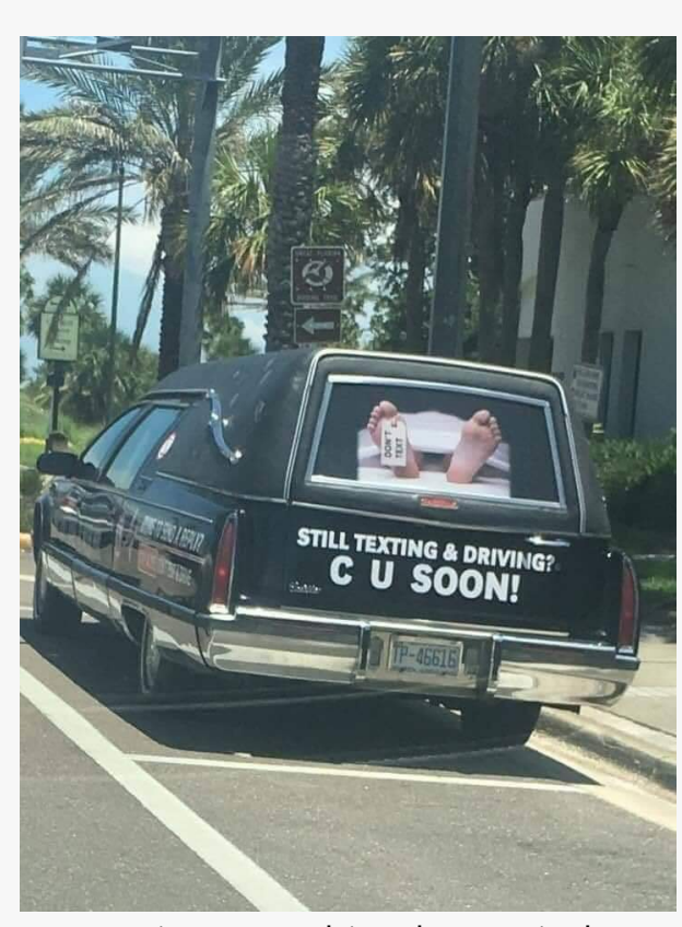
Heaven can wait. DON'T drive destructively!