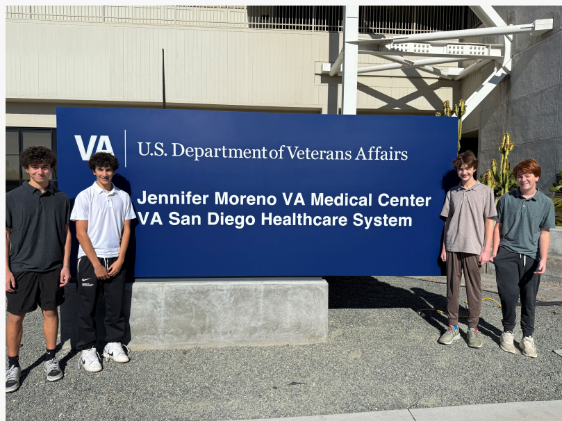
Tech-Angels establish partnership with VA San Diego

Tech-Angels continues to seek volunteers and donations to expand the initiative, ensuring that all senior veterans have the opportunity to benefit from the resources and support they deserve. For more information about how to get involved or to donate, please visit www.tech-angels.org .