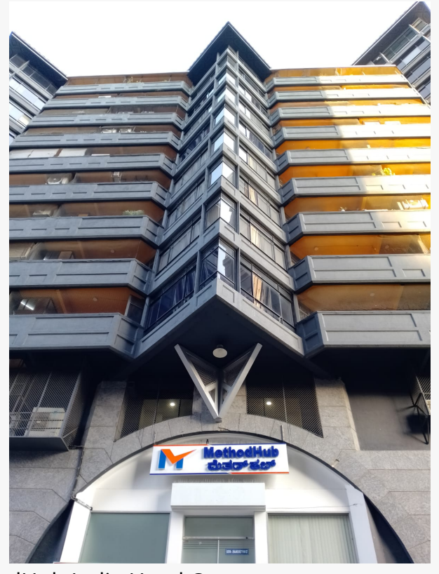
MethodHub India Head Quarters