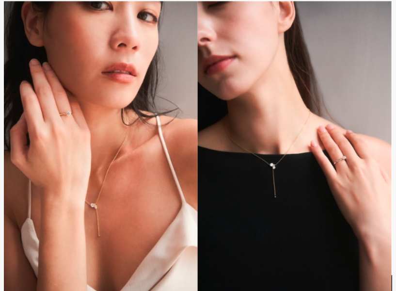
TFR x LIGHTBOX JEWELRY Essence Collection

diamonds set in either 18K yellow or white gold. Additionally, you can choose blue or pink lab-grown diamonds in 18K white gold, with the ring showcasing a captivating 0.5-carat diamond at its heart and an elegantly delicate drop necklace adorned with 0.78-carat lab-grown diamonds. These versatile and stylish pieces are perfect for everyday wear and can be beautifully layered for any occasion, day or night.