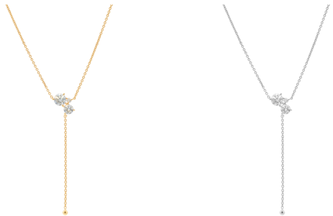
TFR x LIGHTBOX JEWELRY Essence Lariat Necklace