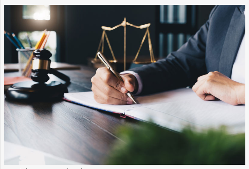
Accident Legal Advice -