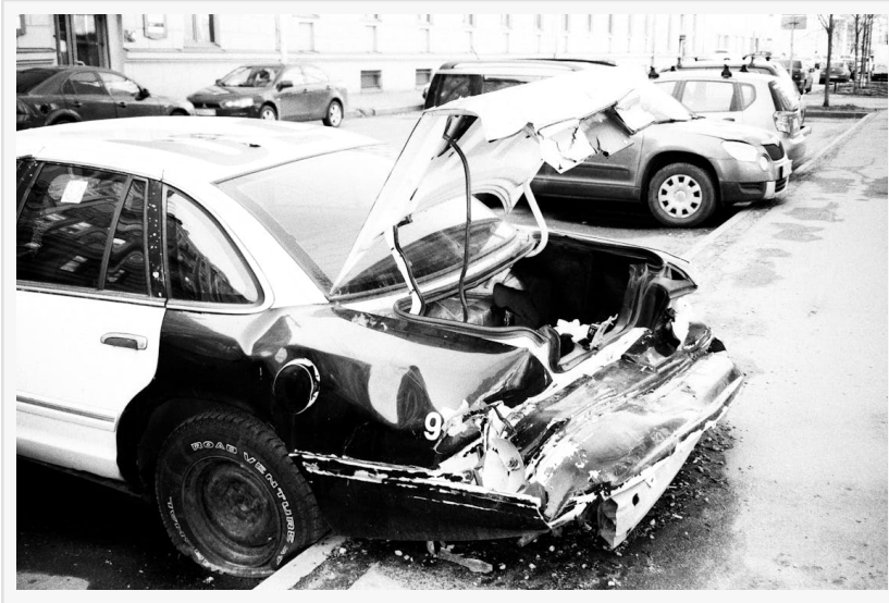
Car Accident Post Falls -

Driving Efficiency Without Compromising Quality