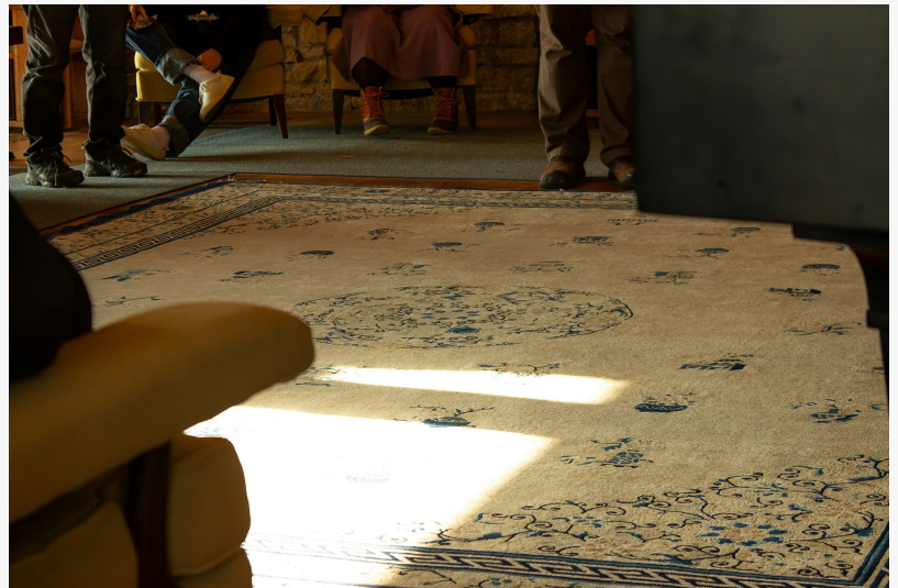
Area Rug Cleaning in Santa Monica