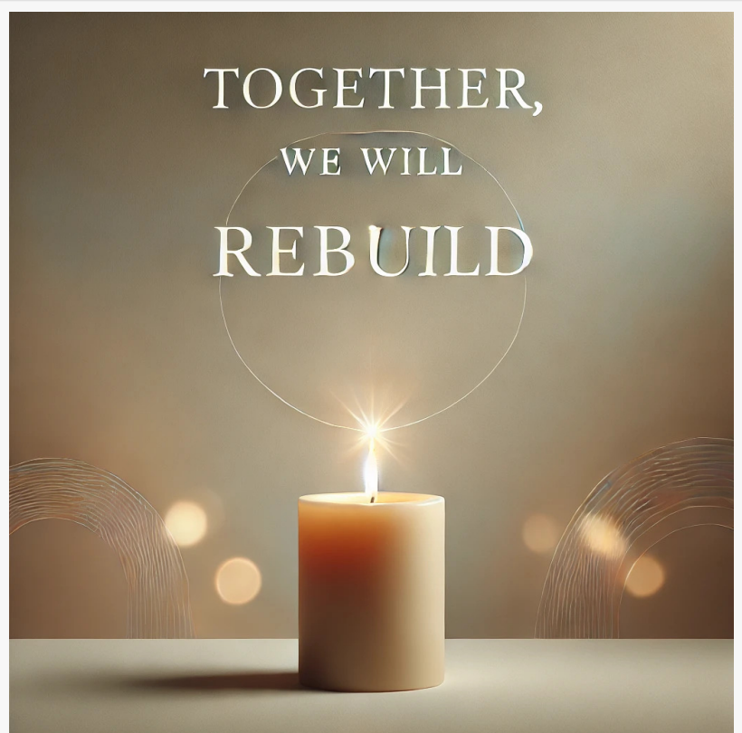
Together We Can | Wildfire Recovery Services

HVAC System Cleaning: Ensuring that smoke particles and debris are not circulating through air systems, protecting indoor air quality.