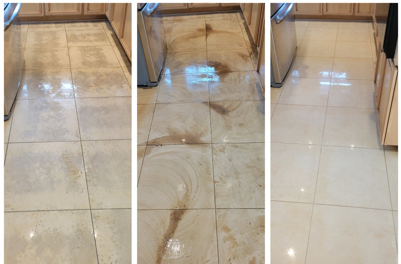
3 panel photo of tile and grout cleaning: dirty, scrubbed, cleaned