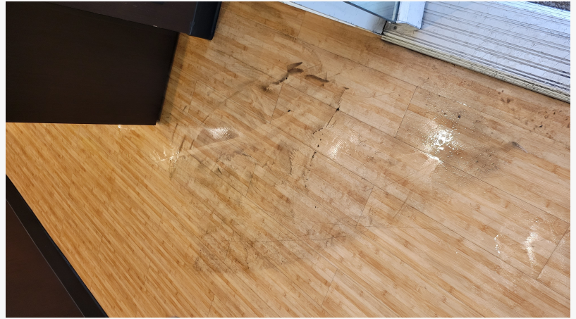
cleaning wood floors

The aftermath of a fire can be overwhelming, with lingering smoke and soot posing both immediate and long-term risks. Discoloration, corrosion, and health concerns from toxic particles make professional intervention essential. JP Carpet Cleaning's expertise in fire damage restoration ensures a thorough approach that addresses all visible and hidden damage, providing peace of mind for property owners.