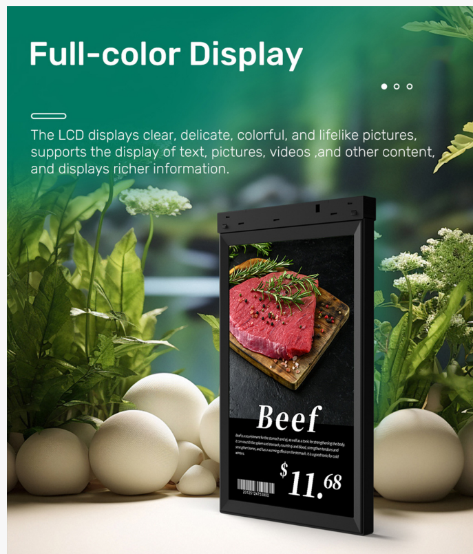
LCD Display Signage