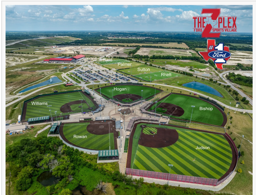
The Z-Plex Texas Sports Village

MELISSA, TX, UNITED STATES, January 21, 2025 /EINPresswire.com/ -- The Athletic Club is proud to announce its latest partnership with Melissa Sports LLC and Ford Sports Village at The Z-Plex in Melissa, Texas. Beginning February 1, 2025, The Athletic Club will officially take over all food and beverage operations across the Z-Plex campus, bringing its signature hospitality and athlete-focused programming to one of the premier sports destinations in the nation.