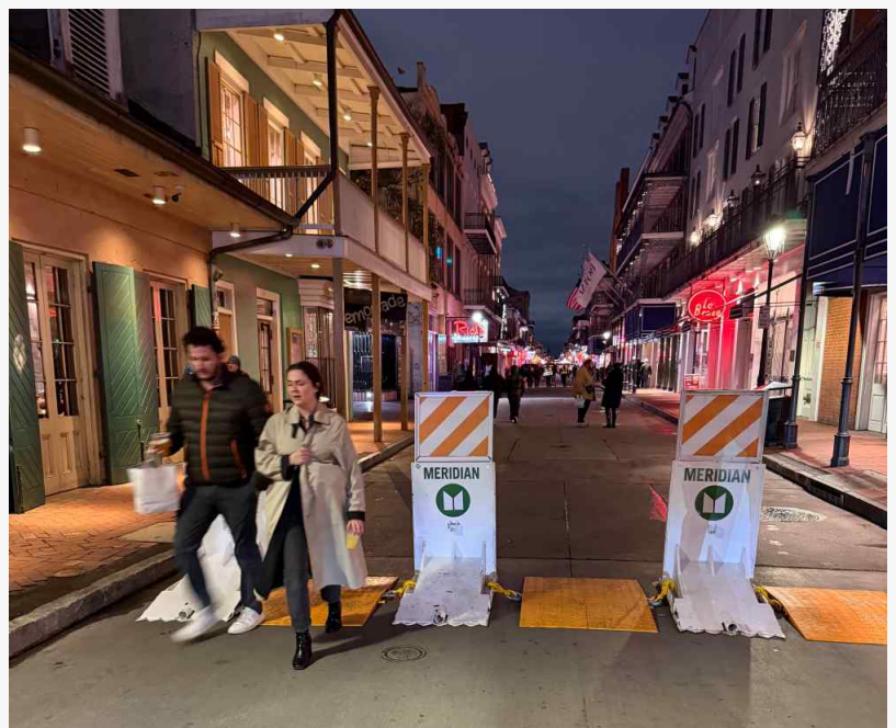
Bourbon Street Protection