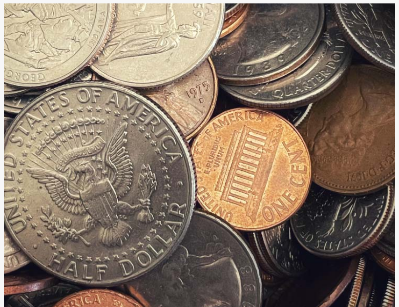
Houston invoice factoring companies