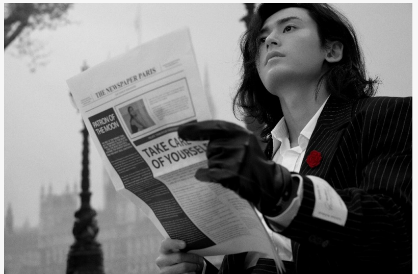
Lost in London