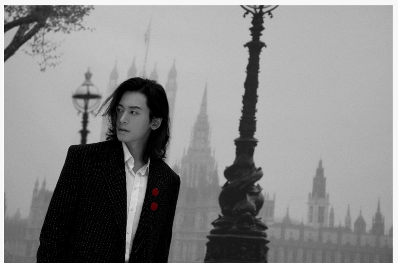
Lost in London