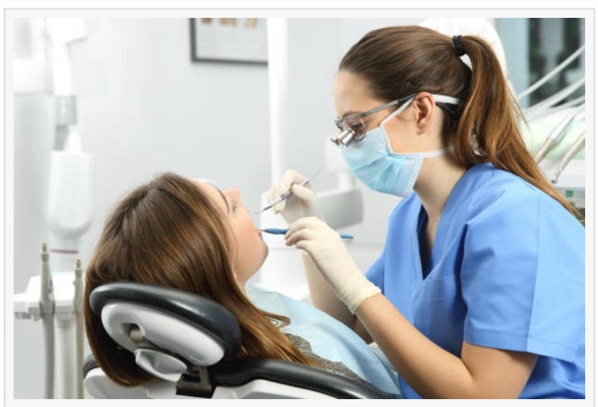
Dental cleaning -

Oral hygiene plays a significant role in an individual's overall health, and dental cleanings are fundamental to preventing various dental issues. Regular dental cleanings performed by licensed professionals help reduce plaque buildup, remove tartar, and prevent the development of gum disease. While brushing and flossing are critical aspects of oral care, they may not fully eliminate plaque that