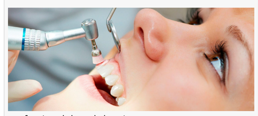
professional dental cleaning

Understanding the Types of Dental Cleaning