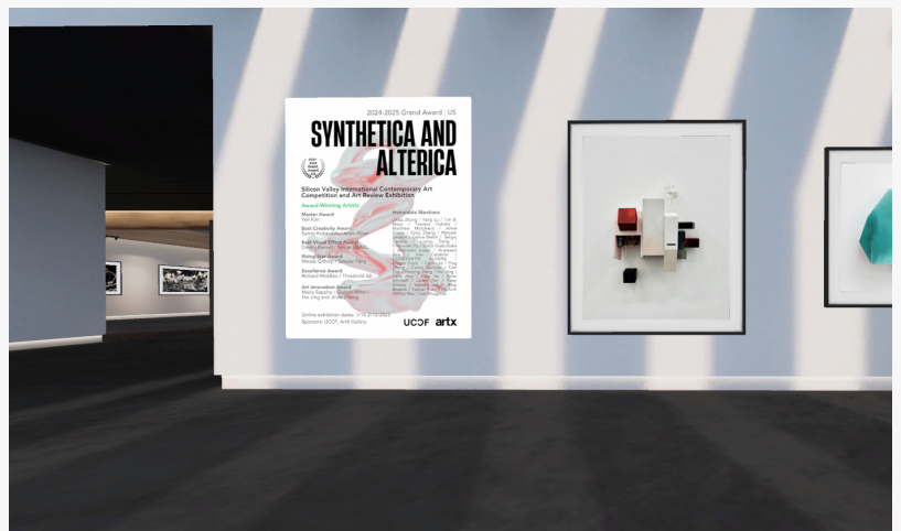
Synthetica and Alterica Exhibit