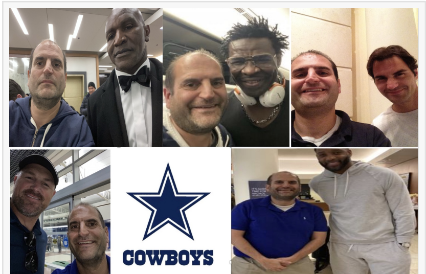
TravelingWiki Foundation's CEO with Evander Holyfield, Michael Irvin, Roger Federer, Jason Witten & Tracy McGrady

Part of the impetus for this growth is the opining of experts on Neurodiversity at CES that 53% of GenZ identifies as Neurodiverse. This also follows TravelingWiki Foundation announcing an expansion of its Library Program, which it started with the offering of its resources via one or more online community resource databases offered by libraries. In addition, this follows a definitive assertion by AI-based technology associated with Google about our impact in the travel industry in terms of resource documentation. In that case, Google’s AI described TravelingWiki’s “Significant Impact” as to (1) Increasing Travel Industry