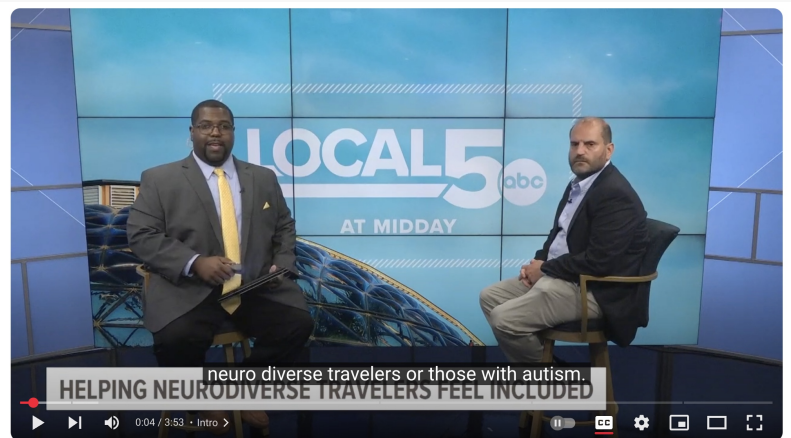
Traveling Wiki aims to help neurodiverse travelers feel included