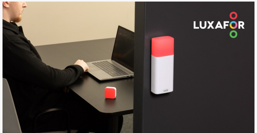
The Iterated Version Of The Switch Pro 2 That Features The Improved Cube 2

To learn more about Luxafor's journey and products, visit www.luxafor.com .