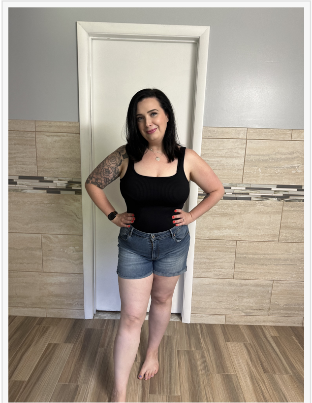
4ward Wellness Patient After Their Endobariatric Procedure