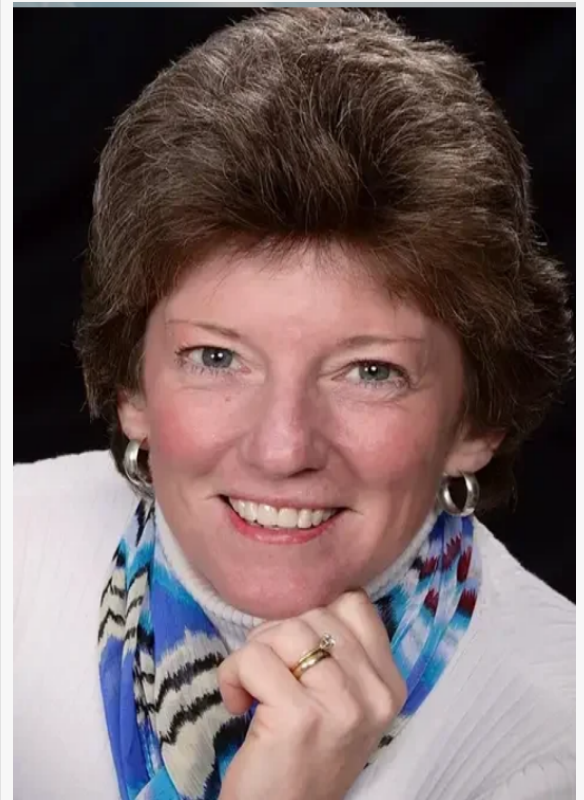
Author Bainy Cyrus