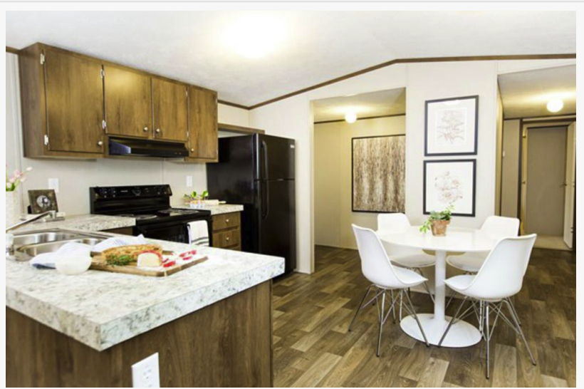
Manufactured Housing Consultants Provides the highest quality mobile homes

MHC modular homes are quickly becoming popular for their exceptional construction quality and value. Constructed in controlled factory environments, these homes reduce waste and enhance building efficiency. This manufacturing method not only guarantees superior quality and precision but also significantly shortens the building timeline compared to traditional site-built homes.