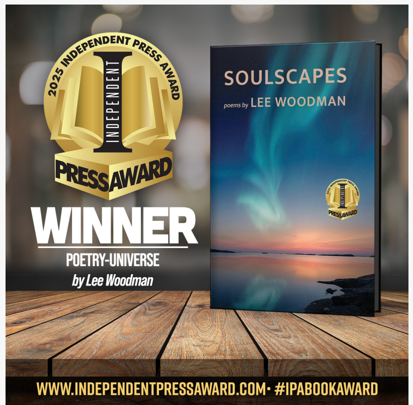
2025 Independent Press Award Winner