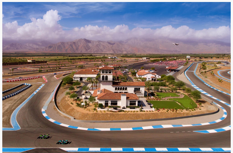
The Thermal Club, one of the world's most cutting-edge private motorsports facilities

THERMAL, CA, UNITED STATES, January 22, 2025 /EINPresswire.com/ -- The Thermal Club , one of the world's most cutting-edge private motorsports facilities, is set to raise the excitement of the NTT INDYCAR SERIES with The Thermal Club INDYCAR Grand Prix, taking place March 21-23. A limited number of exclusive 3-day VIP passes are now available. Secure yours today at www.thermalgp.com .