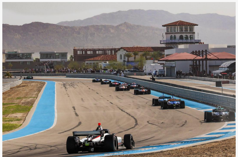
The Thermal Club