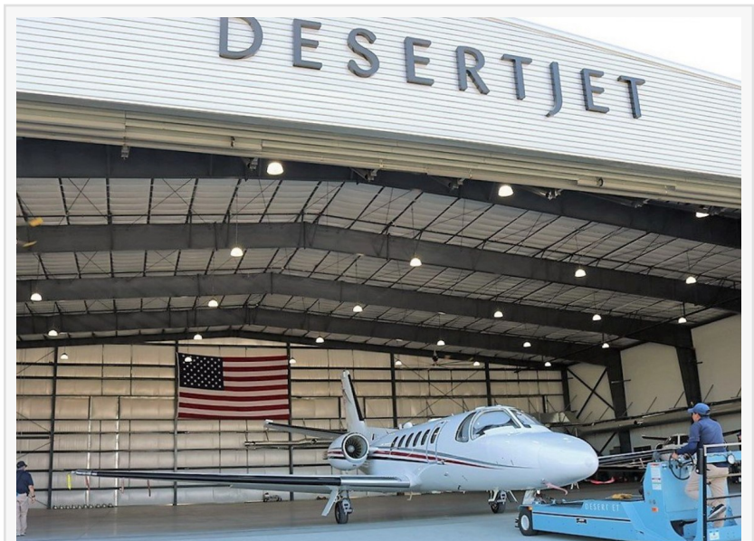
Desert Jet, Exclusive travel partner