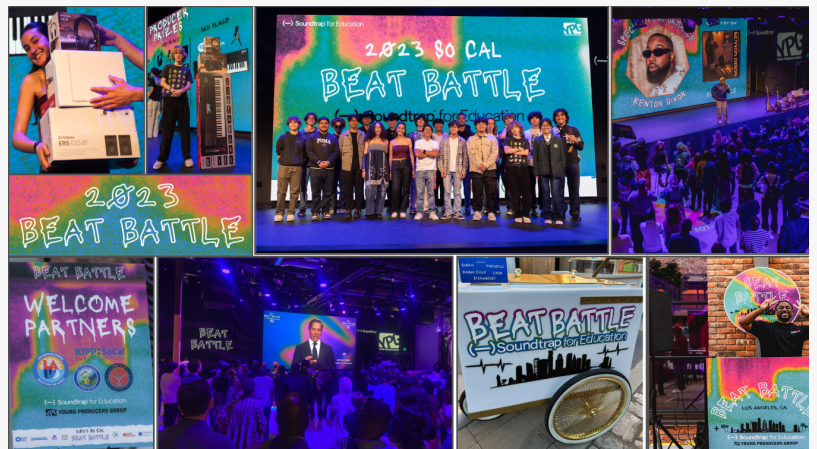
Beat Battle Images!