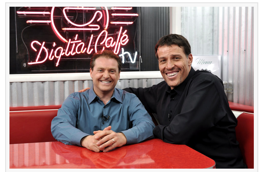
Mike Koenigs and Tony Robbins

The webinar will showcase practical applications of AI in business, including advanced funnel campaign strategies, content creation automation for multiple platforms, and innovative approaches to building self-managing businesses through AI integration.