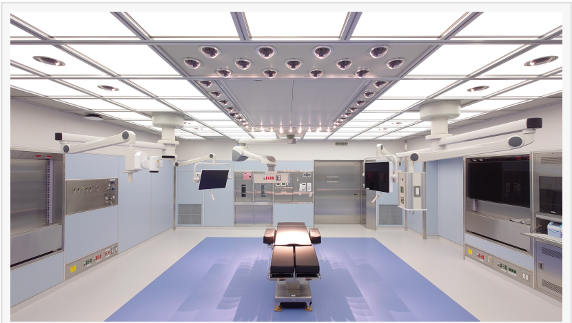
Concept image of Ceiling-Lit Operating Room "OPELUMI"

In order to address these issues, Obayashi Corporation and Osaka University Graduate School of Medicine have jointly developed a lighting system for operating rooms, combining moving, high-luminance, high-color-rendering, automated shooting lights to illuminate the operation area, and