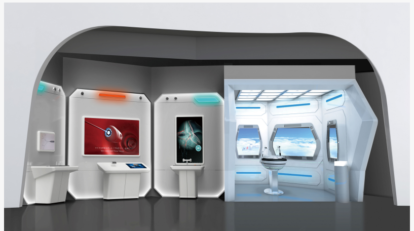
"Future of Medical Care: Remote-Controlled Flying Operating Room"