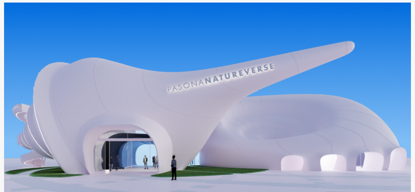
"PASONA NATUREVERSE" exterior concept image