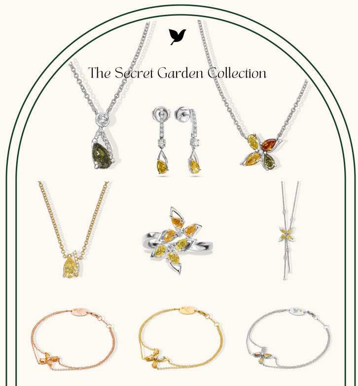
The Secret Garden Collection captures the magic of a floral garden, with elegant silhouettes and timeless designs. Crafted from Natural Fancy Color Diamonds & 14K Gold.