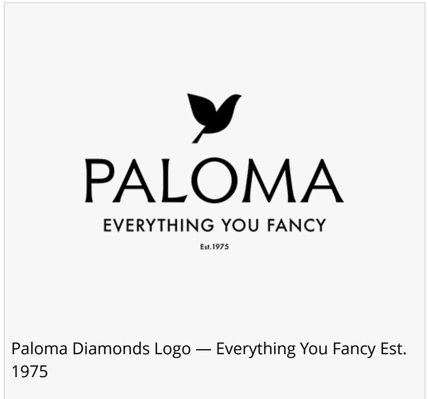
Paloma Diamonds Logo — Everything You Fancy Est. 1975

NEW YORK CITY, NY, UNITED STATES, January 27, 2025 /EINPresswire.com/ -- Paloma Diamonds Inc. (Paloma Diamonds) today announced the launch of its signature Secret Garden Collection , a breathtaking line of natural fancy color diamond jewelry featuring iconic designs for the modern woman. This collection offers luxurious yet versatile jewelry with timeless appeal, inspired by the beauty of nature and crafted for every mood, occasion, and moment.