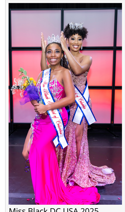
Miss Black DC USA 2025 Crowned

The DMV Daily is redefining media by embracing community storytelling (a model that elevates authentic voices from the region to foster connection, inclusivity, and empowerment.