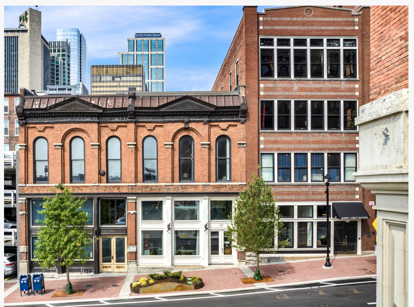
217 2nd Avenue North, Nashville, Tennessee