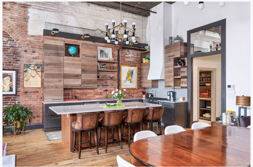
Unique mixed - use live/work urban property