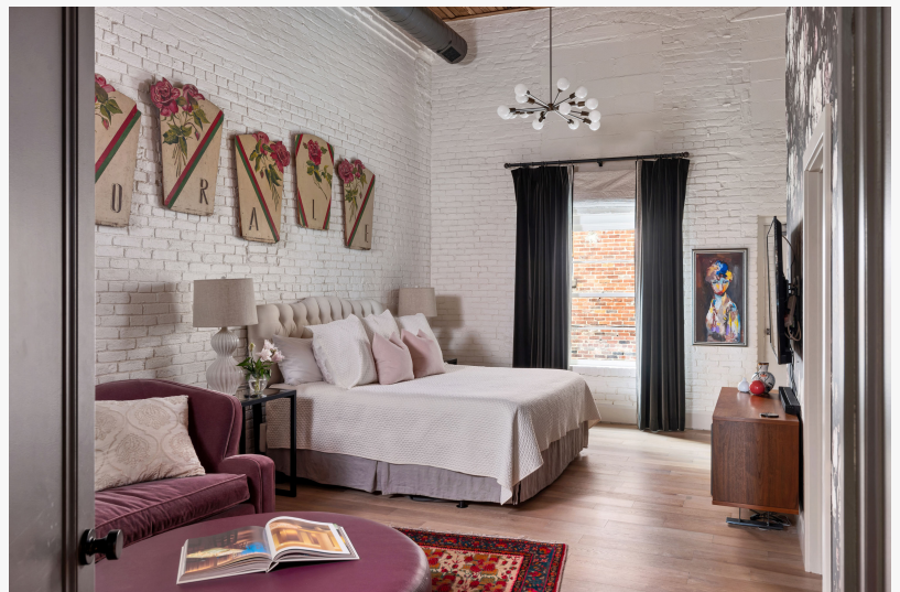
Residential unit designed by award - winning design studio