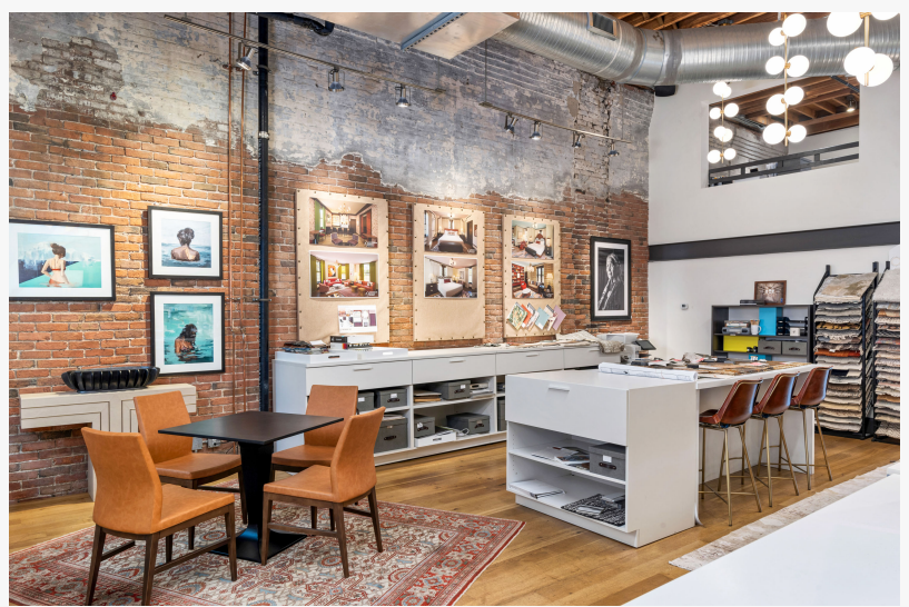
Professional recording studio and offices

Located on the revitalized "North Block" of Second Avenue North, with