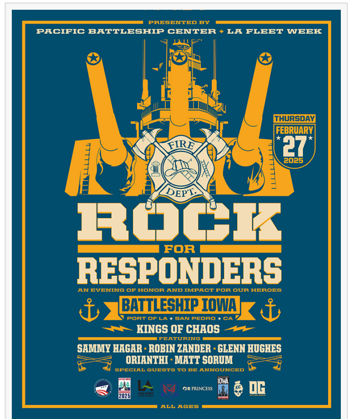
Logo for the Rock for Responders benefit concert

This press release can be viewed online at: https://www.einpresswire.com/article/779670245