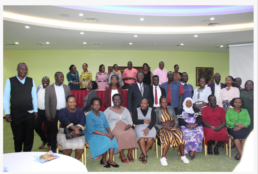
LWB Uganda Foster Care Conference