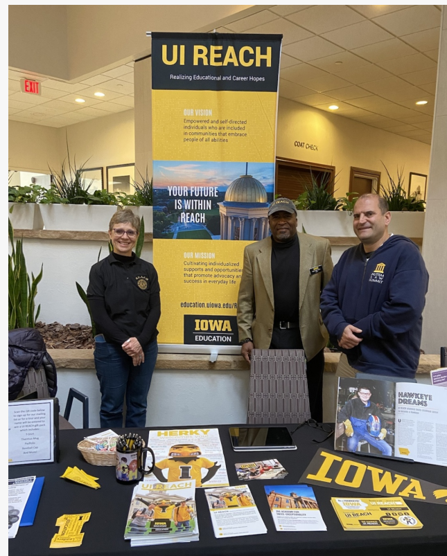
TravelingWiki Foundation with Leaders of the University of Iowa's Renowned Reach Program, Where TravelingWiki's CEO Recently Lectured