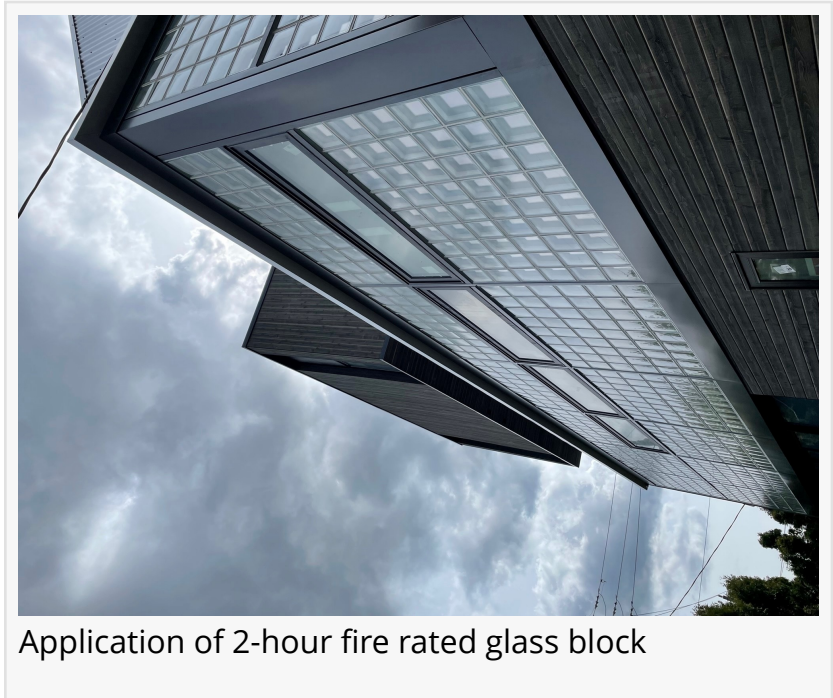
Application of 2-hour fire rated glass block

"Whether for residential or commercial applications, Clarity transforms dark, confined spaces into bright, inviting areas while meeting stringent fire safety standards," Boesch added. "It's also an excellent sound barrier and insulating value (U-Value of .28), making it perfect for spaces where noise reduction is crucial."