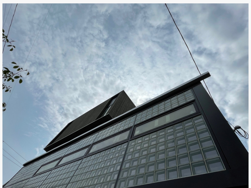
Application of 120-minute fire rated glass block