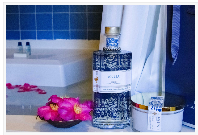
Bay Dreams at Sandaway™—a new in-room bathing add-on available from Sandaway Suites & Beach. Featured here is the soaking tub for two in the Waterview Sandaway Suite.