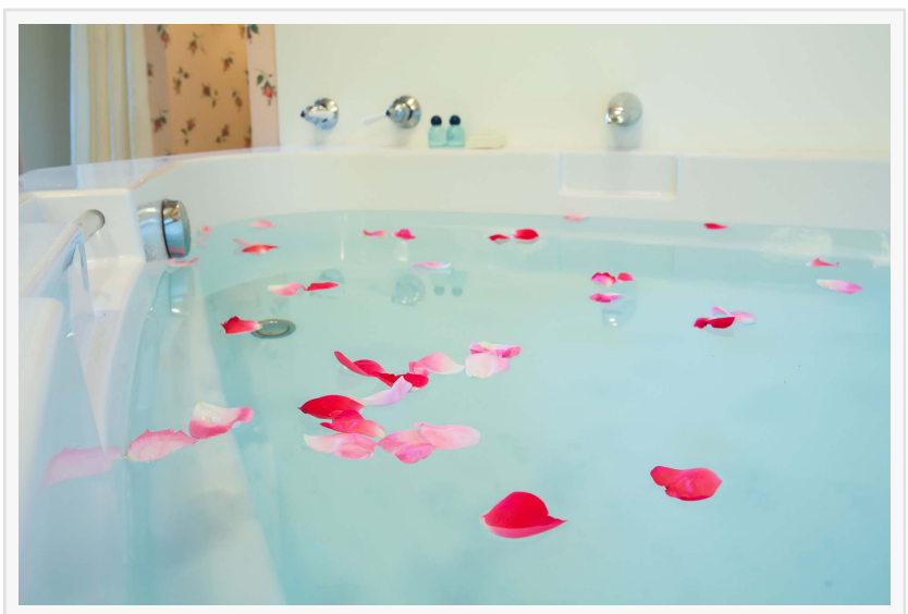
Chesapeake Suite - Michener's Choptank Cottage Hideaway at Sandaway Features a Soaking Tub for Two and King Bedroom