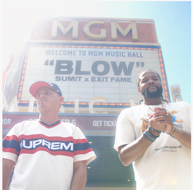
SUMiT ft. EXITFAME "Blow" Album Art