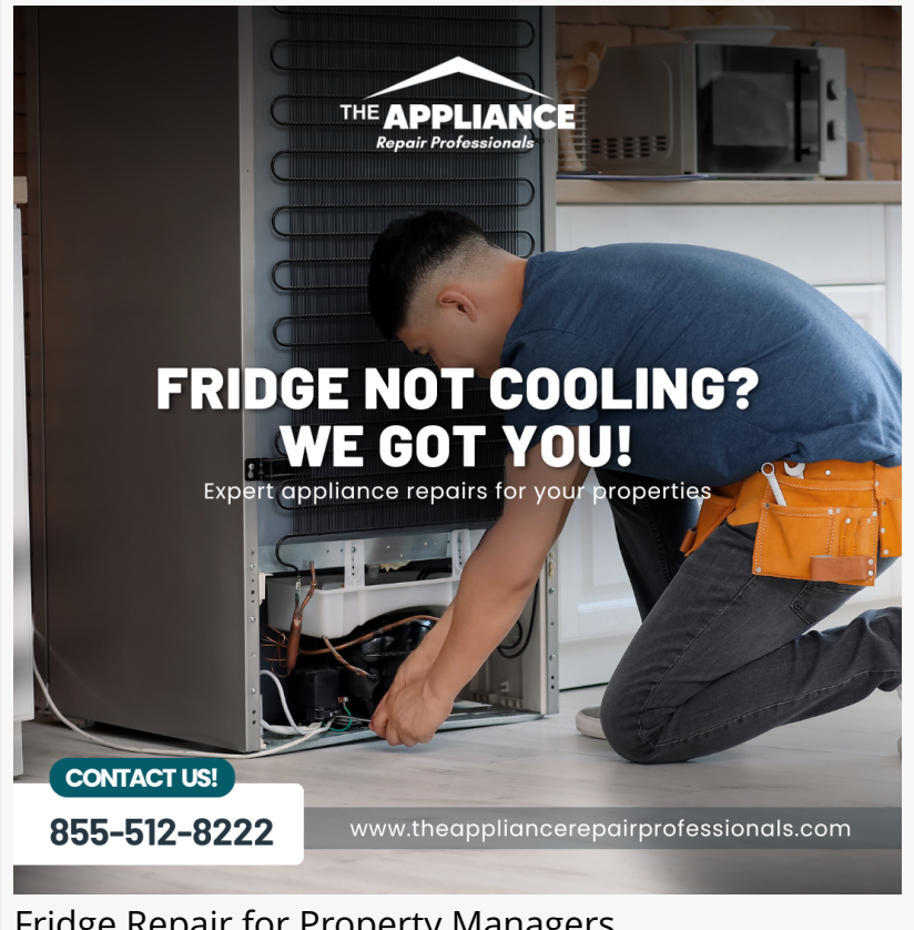
Fridge Repair for Property Managers

encouraged to consider factors such as payment policies and performance records. By prioritizing accountability and transparency, The Appliance Repair Professionals streamline the