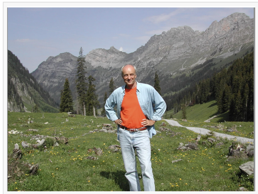
German-born composer CG Deuter's music is inspired by nature, among other things.

Deuter's inspiration for Mångata can be seen as an extension of his lifelong quest to use music as a tool for personal and collective healing, promoting a sense of inner peace and cosmic harmony, and expressing a deep connection with the natural world by receiving inspiration from it. He is known for creating music that encourages inner peace, healing, and slowing down the madness of this world. The album invites the listener to feel both grounded and uplifted, much like the connection between the earth and the moon's reflected light.