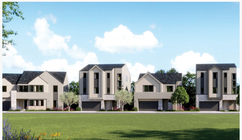
The sustainable homes at Vue222 in Austin, Texas