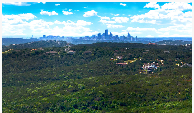
The stunning views from Vue 222 in Austin, Texas

With a variety of floor plans designed with the view-in-mind, each home maximizes natural light and will reflect the owner's personality and tastes. Showcasing Modern Scandinavian design, the