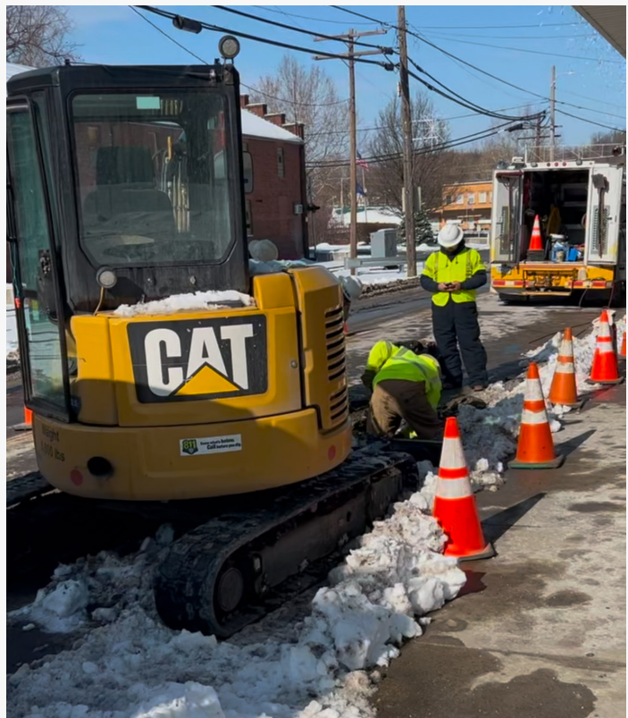
Columbia Gas turning off the Gas.