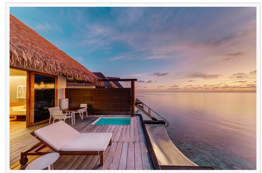
Sunset Water Bungalow with Jacuzzi at Cinnamon Velifushi Maldives

The resort provides opportunities for relaxation and wellness, offering yoga sessions led by an in-house instructor,