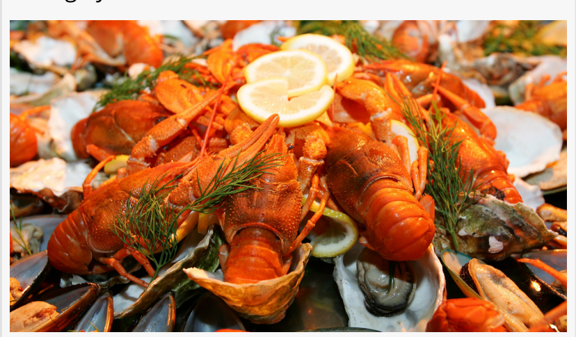
Baked Lobster at Cinnamon Velifushi Maldives