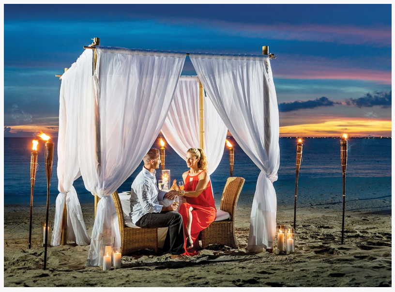
Dining by the beach at Cinnamon Velifushi Maldives