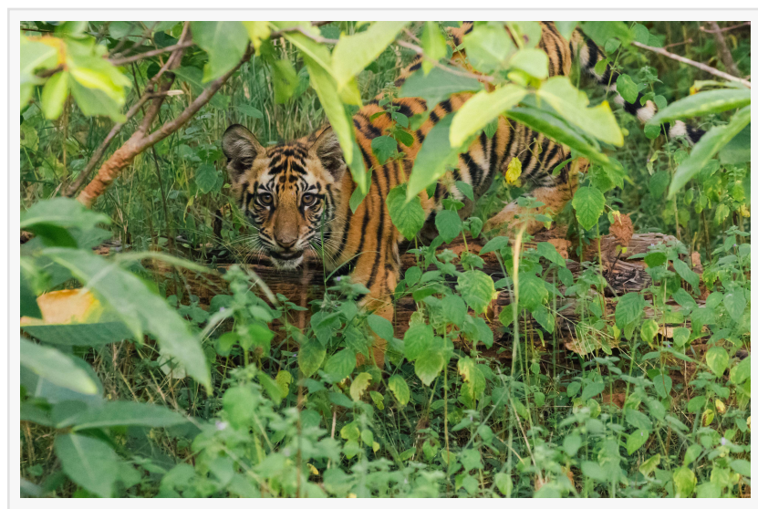
Tiger Cub spotted at Sanjay Dubri National Park

AS Madhya Pradesh Tourism Board email us here