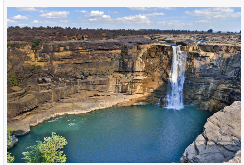
Keoti Waterfall, cascading amidst the lush landscapes of Rewa, Madhya Pradesh

The Barcelona roadshow is part of Madhya Pradesh Tourism Board's broader strategy to position the state as a top-tier destination for global travelers. Through this engagement with Spanish stakeholders, the Board aims to boost the visibility of Madhya Pradesh's unique offerings and strengthen tourism ties between Spain and India.