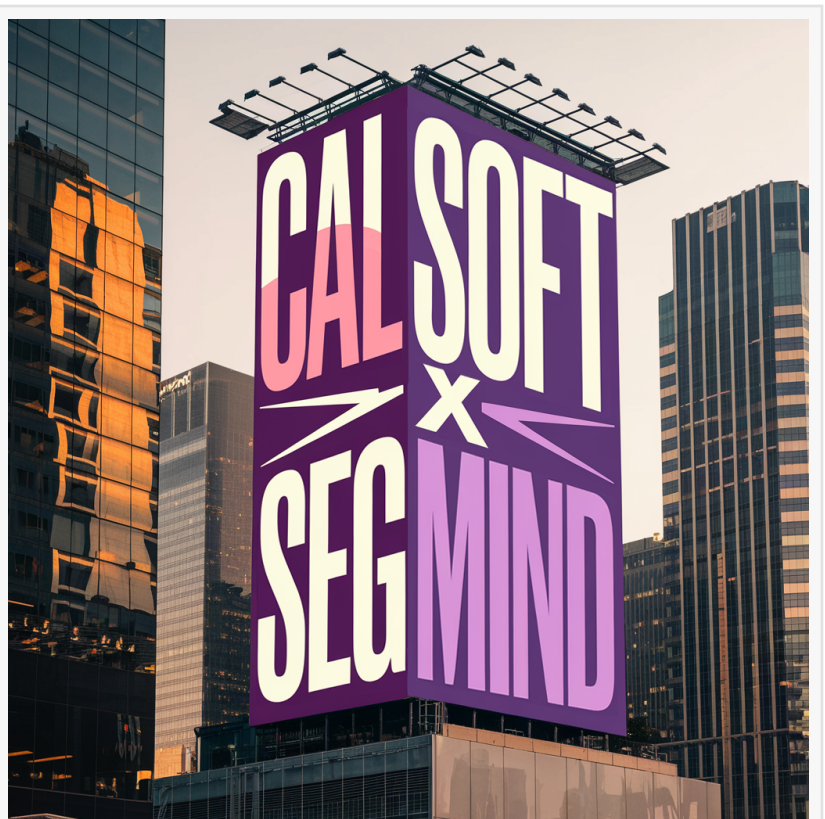
Calsoft and Segmind

Calsoft is a leading technology-first partner providing digital and product engineering services. For over 25 years, Calsoft has been helping its customers solve business challenges using advanced technologies across storage, virtualization, networking, security, cloud, AI/ML, IoT, and telecommunications domains. Calsoft's expertise spans industry verticals, delivering tailored solutions that drive operational efficiency and growth. Our solution accelerators and frameworks augment go-to-market plans and expedite product launches to meet customers.