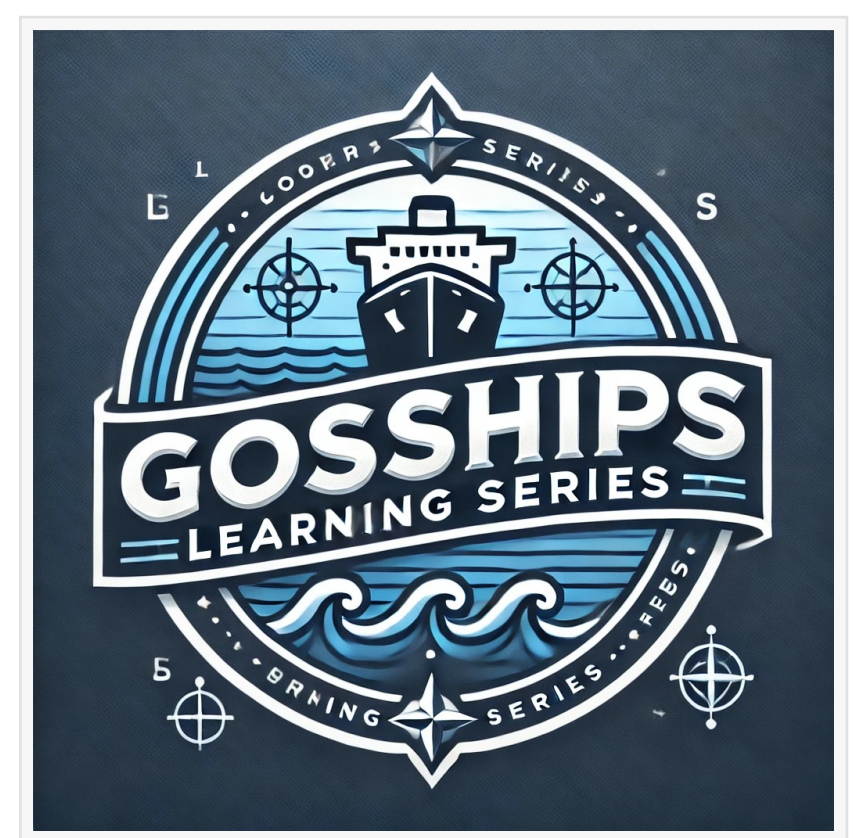
Gosships Learning Series: Empowering professionals with expert-developed training and insights for the maritime and offshore industries.

The updated platform also introduces SwiftAction Training, a strategic compliance solution that tackles urgent industry challenges such as audit nonconformities and post-detention