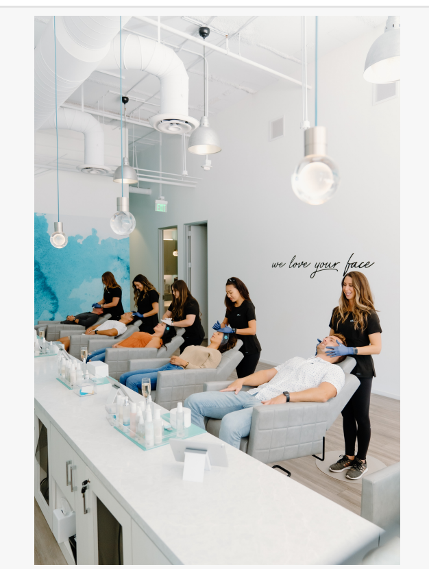
Facialworks Facial Bar

Each facial begins with a complimentary drink of choice and a thorough consultation with an esthetician, to ensure a seamless experience. Every facial includes a