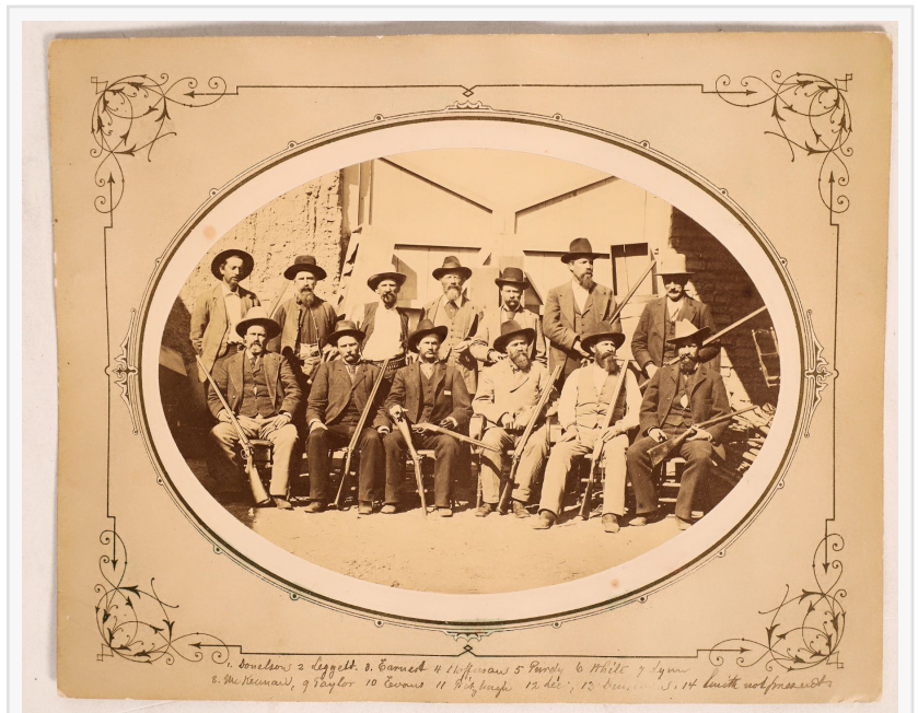
Mounted original albumen photo from 1881 of 13 men who made up a posse sent from Tucson to Yuma to take over the goods from a suspected huge retail goods swindle (est. $2,500-$7,500).

The numismatics category on Day 3 will be led by a Carson City Mint treasure: a pair of 1871 documents appointing the melter/assayer for the Mint, with one