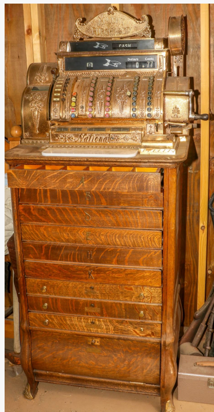
9-drawer National Cash Register (Dayton, Ohio) from 1914, in mint condition, with exquisite design and durability, having original mechanism and intricate details (est. $10,000-$15,000).