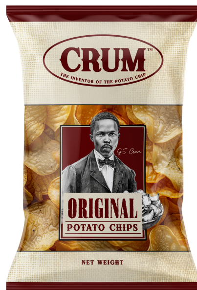
Crum original chips

Crum created potato chips out of frustration. A regular patron of the Moon Lake House ordered fried potatoes, which Crum completed, only for them to be returned to the kitchen, along with the comment that they were too thick and soggy. This proved to be a turning point in culinary history. Crum sliced the following batch paper thin and fried it crispy and golden brown. When they were done, he sprinkled them with salt and returned them to the picky patron, and the potato chip was born!