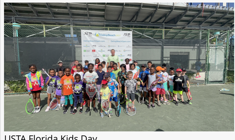
USTA Florida Kids Day

Feb. 12, 2025. Buy one, get one free box or reserved seats for seniors. To receive your special