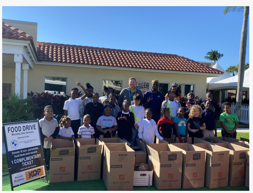
Food Drive with KOP Mentoring Network kids